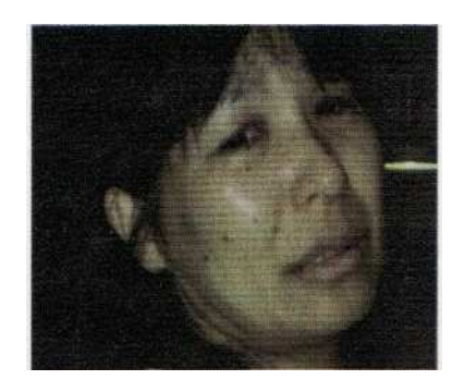
Fig. 1 Woman with an expression

whole body might stiffen. How will you react if the person in Figure 1 were living next to you? How would you feel? What kind of body sensation will you have? What about your facial expression?